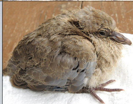
FLEDGLING WHITE-WINGED DOVE BELOW