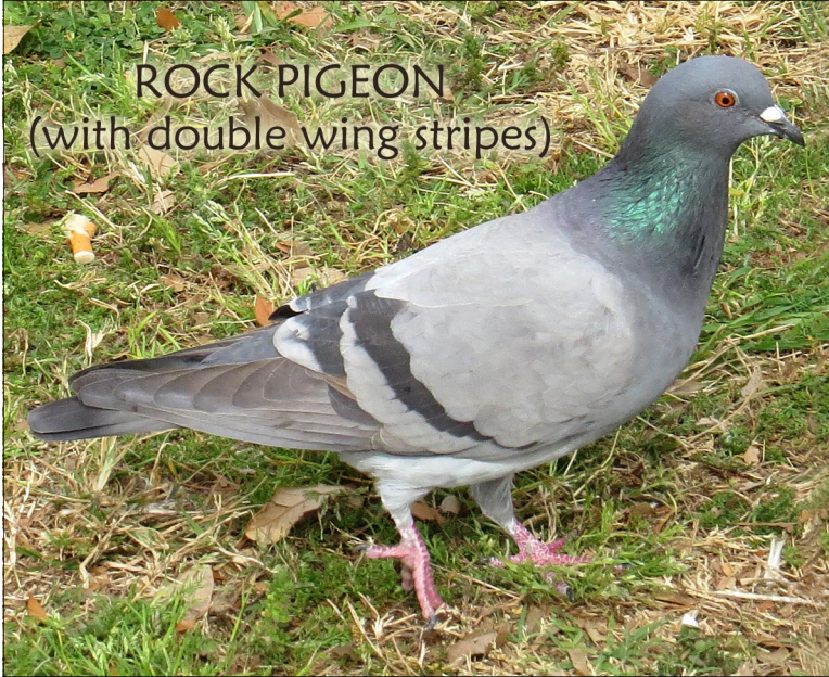
ROCK PIGEON (with double wing stripes)