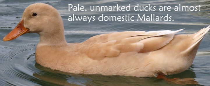
Pale, unmarked ducks are almost always domestic Mallards.