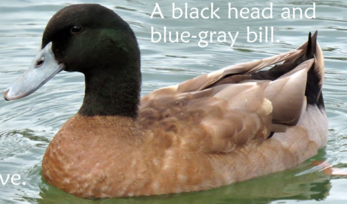
A black head and blue-gray bill.

Six examples of the many different color combinations that domestic Mallards can have.