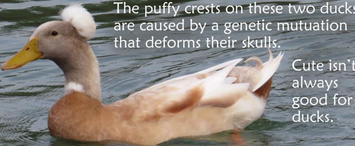
The puffy crests on these two ducks are caused by a genetic mutation that deforms their skulls.