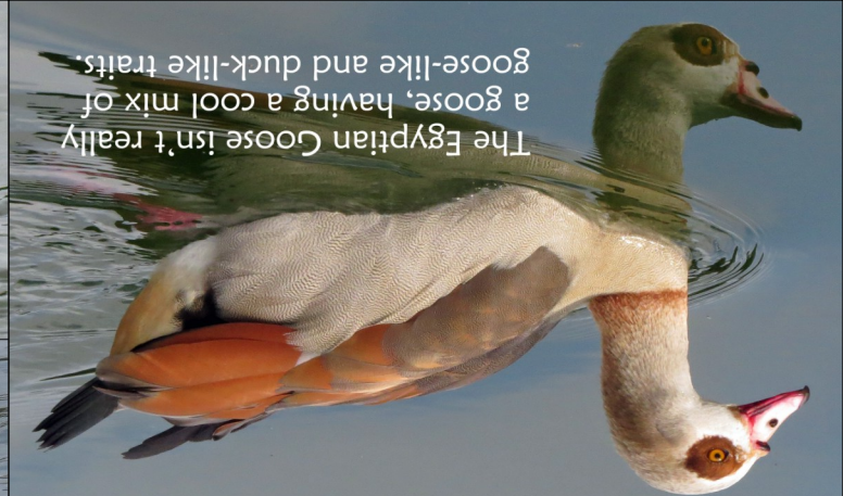
The Egyptian Goose isn't really a goose, having a cool mix of goose-like and duck-like traits.