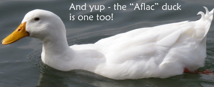
And yup - the "Aflac" duck is one too!