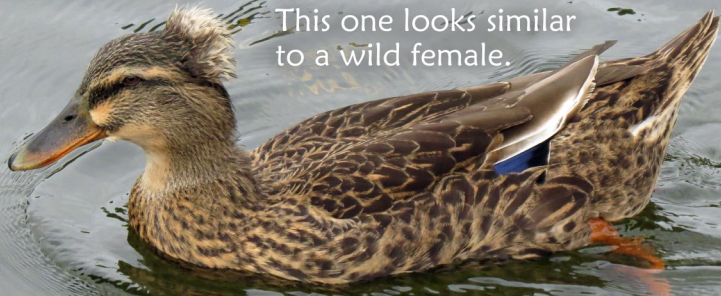
This one looks similar to a wild female.