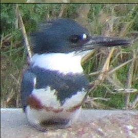
FEMALE ABOVE, MALE TO RIGHT