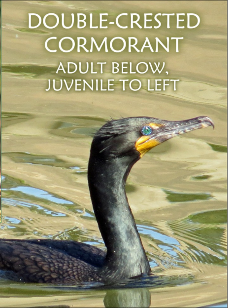
DOUBLE-CRESTED CORMORANT ADULT BELOW, JUVENILE TO LEFT