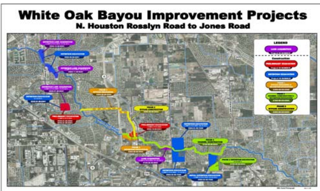
Maps provided by Harris County Flood Control District

Our monthly meetings are held on the third Tuesday of every month, 7:30 PM at Central Bank, Timbergrove Community Room 1550 West 18th Street, Houston—Next to Walgreens at West T.C. Jester